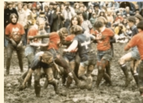
Alpha Phis play in 1976 Mud Bowl.